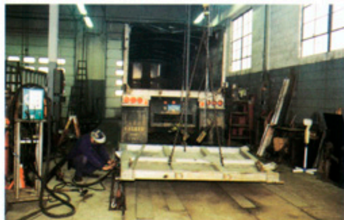
Each drive-through bay has two electrically operated chain hoists. Straightening rails in the floor are used to repair wrecked vehicles.

The former Hale Trailer & Truck Equipment changed its