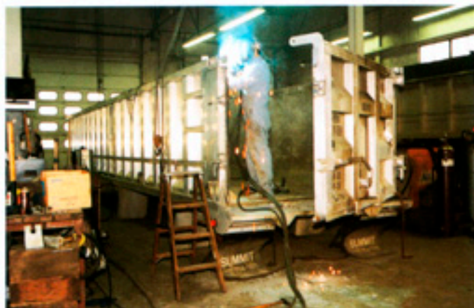
Dump bodies are repaired in one of four specially designed bays with a 24' ceiling height.