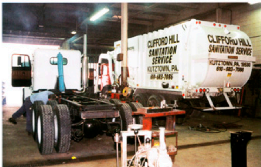
In the older section of the shop, 10 bays are used for truck body and accessory installation and repairs, trailer repair, and chassis modification.

The 80,000-sq-ft Allentown branch provides the trailer dealer with a new "super-service" center that helps balance trailer sales and rentals with service and parts at the three