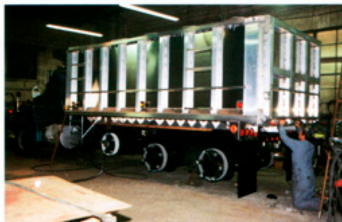
A 17½' Parker aluminum dump body is installed on a Mack CH series truck. Nine technicians produce customized dump trailers, bodies, and chassis.

When Hale acquired Allentown Brake & Wheel, the trailer dealer closed a smaller branch in Bethlehem that had been established in 1987. The Bethlehem branch, only 10 miles from Allentown, was strictly a trailer sales and rental opera-