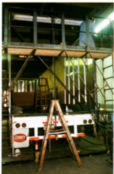
A mechanic on a scaffold repairs a Dorsey van.