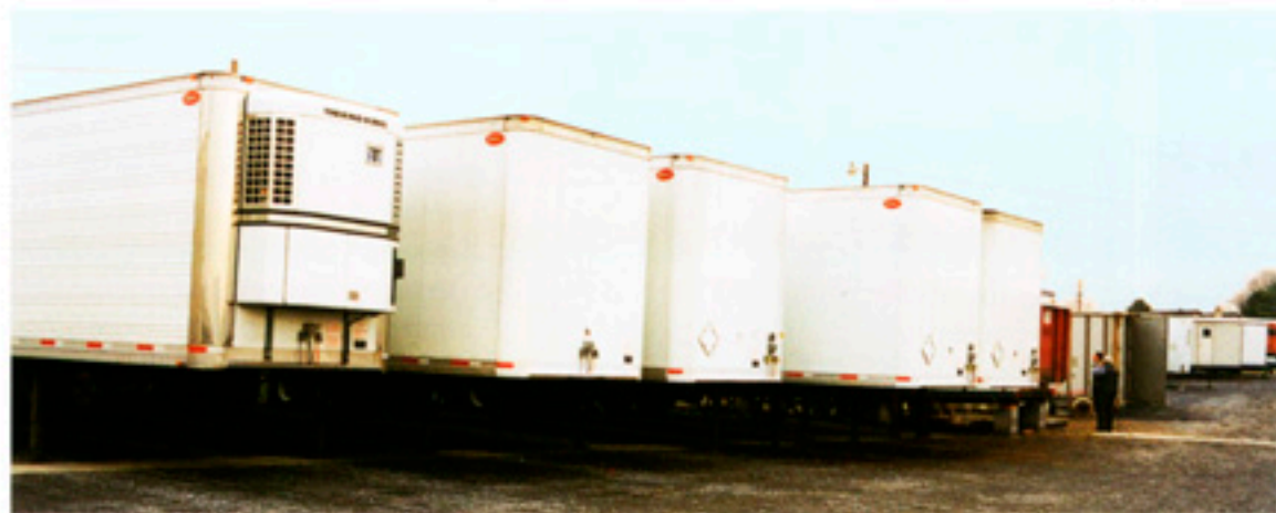
A six-acre lot at the Allentown branch is home base for about 800 of 2,500 trailers in the Hale rental fleet.