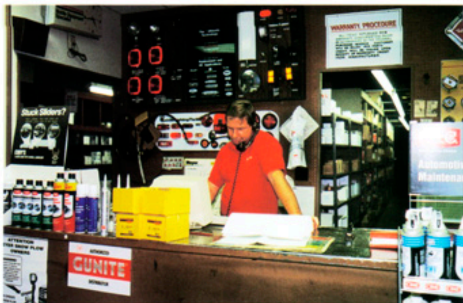
Hale Trailer carries a full line of trailer and truck equipment parts supplying fleets, jobbers, small parts houses and repair companies, plus the Hale repair shop.

branch had no shop. "When this offer came, we already were considering the options of building a shop in Bethlehem or buying another facility," he says.